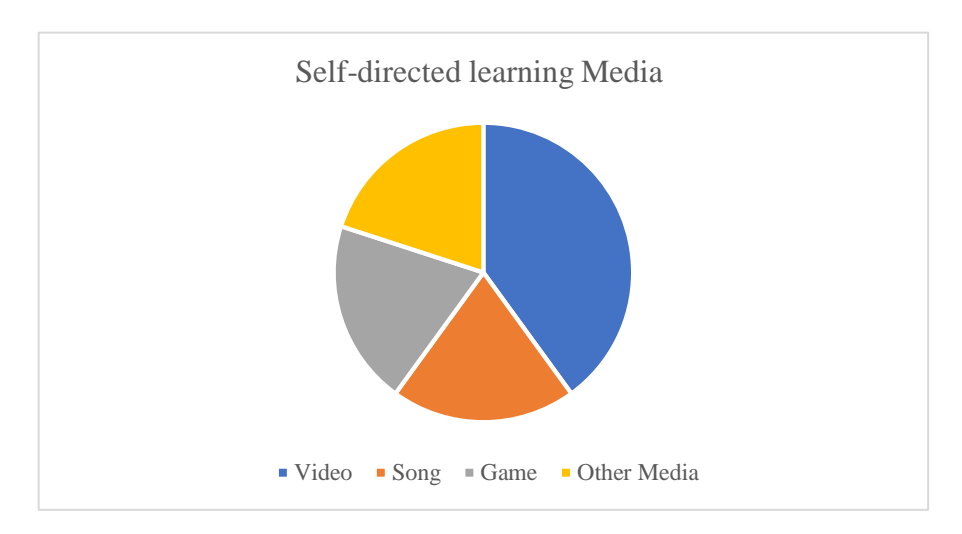
Figure 3: The percentage of self-directed learning media that students used