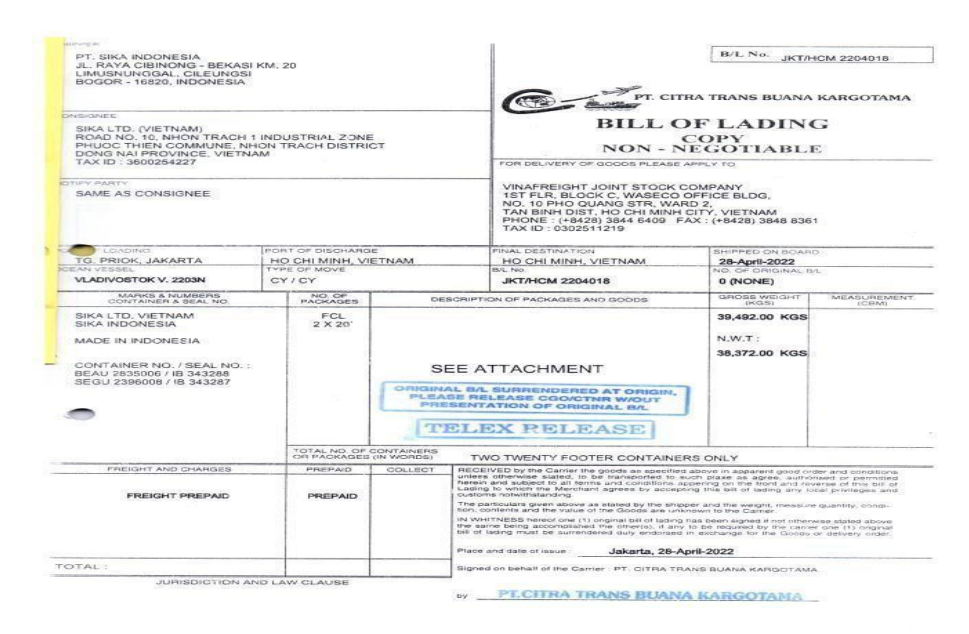
Figure 5: Bill of loading of PT. Citra Trans Buana Kargotama Jakarta

Bill of loading is the most important shipping document because it has the nature of a guarantee. The function of the bill of lading is as a receipt (receipt) of goods as proof of the existence of a sea transportation agreement.