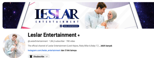
Figure 2. Leslar Entertainment YouTube Image

Qualitative research offers a deep and comprehensive approach in understanding human phenomena and their environment (Yusuf, 2019) By emphasizing the search for meaning, understanding, and symbols, this research explores the complexity and context behind a phenomenon. Through theoretical and interpretive analysis methods, this study investigates the phenomenon of interaction between celebrities and fans on Leslar Entertainment's YouTube platform.